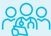
Physician Leadership Program