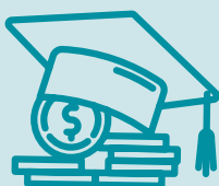
Yearly scholarship opportunities with Rotman's MBA for health care and the life science program.

Contact the OMA for additional information and how to apply. Email: info@oma.org